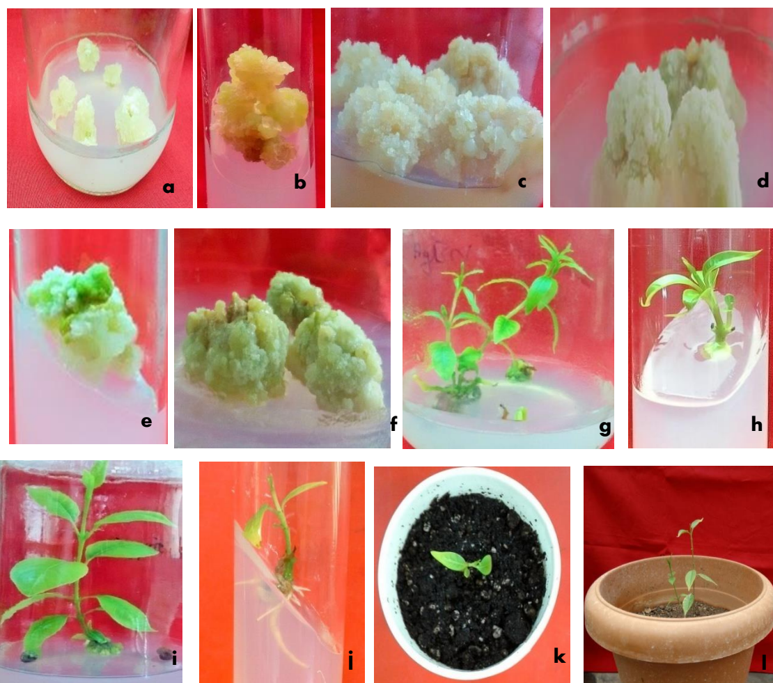
Fig.1: a-f – Induction of callus from leaf explant: a) MS +BAP (0.5 mg/L) + 2, 4-D (1 mg/L), b) MS + BAP (1 mg/L), c) MS + 2, 4-D (2 mg/L), d) MS + BAP (2 mg/L) + 2, 4-D (1 mg/L), e) MS + NAA (0.5 mg/L) + BAP (1 mg/L), f) MS + BAP (1 mg/L) +NAA (0.5 mg/L), g - Direct regeneration from Shoot tip MS + BAP (2 mg/L) + NAA (0.5 mg/L), h & i - Direct regeneration from nodal explant; h) MS + BAP (0.5 mg/L) + NAA (0.5 mg/L) & i) MS + BAP (1 mg/L) + NAA (0.5 mg/L), j) MS + NAA (0.2 mg/L), k & l- Hardening and acclimatization.

transferred to half strength MS media supplemented with auxins. The maximum root induction was noticed in media fortified with 0.2 mg/L of NAA and 0.5 mg/L of IBA ( Fig.1 j ). Our results indicate that lower concentrations of NAA and IBA induced maximum number of roots. Samyudurai et al. reported maximum root induction in D. hamiltonii cultured on half strength MS media supplemented with lower concentration of NAA and IBA [22]. The well-developed rooted plants were hardened under greenhouse conditions and around 70% survival rate was recorded ( Fig. 1 k & l ).