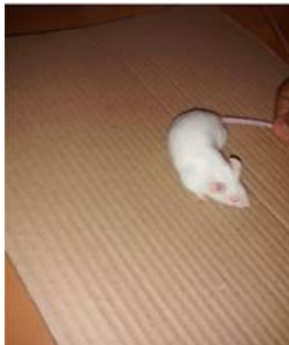
Fig: 1.a. Normal Mice