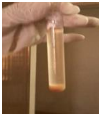
Fig.1. c. Washed DLA cells