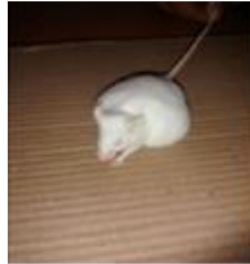
Fig.1. b. Tumor Bearing Mice