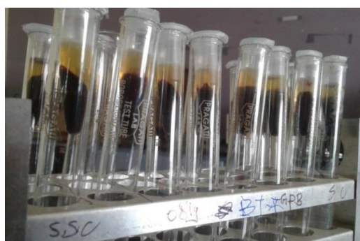
Figure 2: Clot lysis in thrombolytic activity

% of clot lysis= (Weight of lysed clot/weight of clot before lysis) ×100