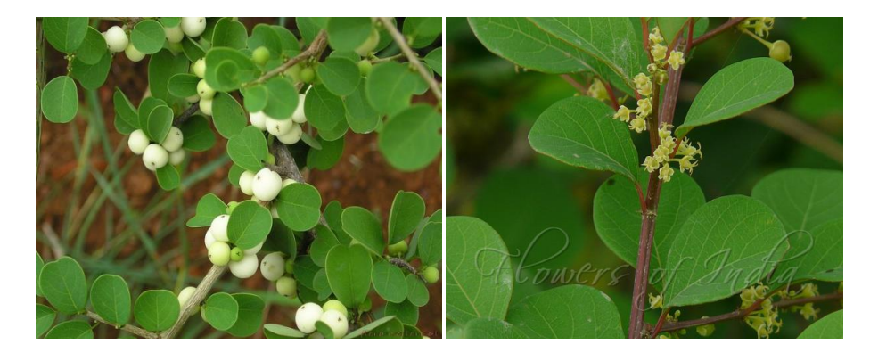
Fig 1: Stem of Securinega leucopyrus

It is used topically in paste form for healing of chronic and non-healing wounds<sup>3</sup>. The leaves of the plant contain germicidal properties. The decoction of leaves is used to dress the cancerous wounds and also used externally in the treatment of piles. The juice or paste of the leaves along with tobacco is used to destroy worms in sores. It is used as popular veterinary medicine. The leaves are used to extract the extraneous materials from body tissues without surgery<sup>4</sup>. Leaves are boiled and taken twice a day for stomach aches. The roots are used in the treatment of testicular enlargement and in the cure of edema. The whole plant is used for the cure of cancer in the sole of the foot. It is also used in the treatment of abdominal lumps and liver hypertrophy and portal hypertension. The bark of stem is used for tooth ache⁵.