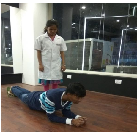
Fig 2: Plank exercise