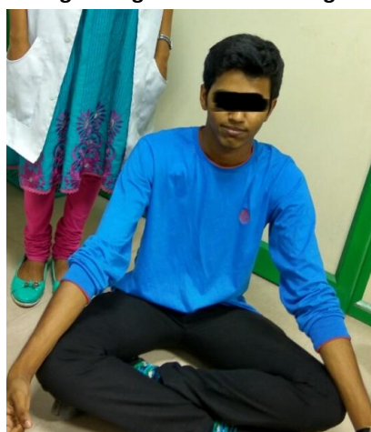
Fig 4: Chanting OM.