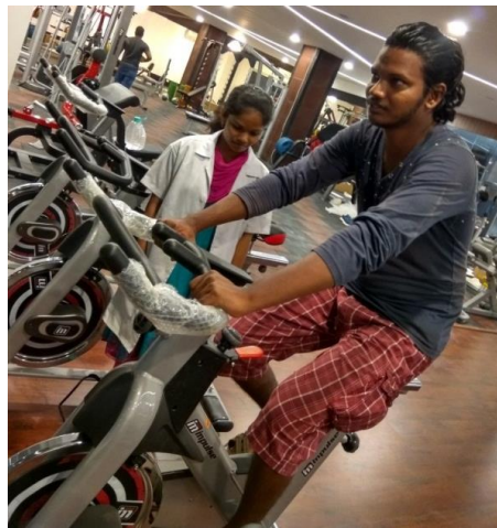
Fig 1: Static Cycling