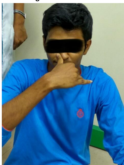
Fig 3: Single nostril breathing.