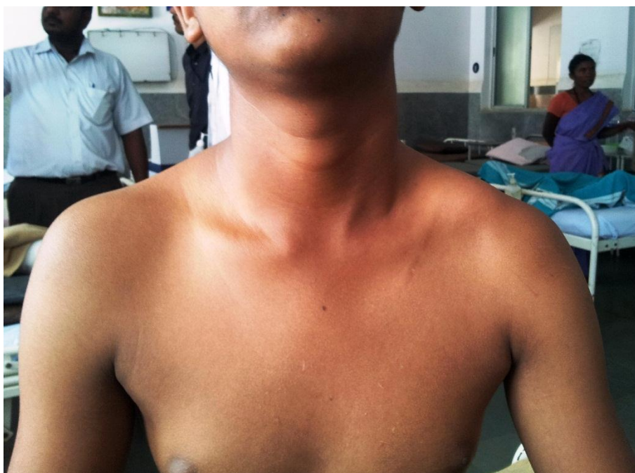
Figure 1: Photograph depicting swelling at the left clavicular region.

The lesion was approached after incising the periosteum longitudinally. It was a multiloculated cyst containing streaks of thrombi ( Fig. 5 ). The inner wall was curetted and electrocautery done to seal the bleeding walls of the cavity. Cavity was further irrigated with iodine containing alcohol solution and cavity was filled with cortico-cancellous strip of autologous iliac crest bone graft. Periosteal tube was repaired and limb was immobilized in cuff and collar sling. Postoperative period was uneventful. The preoperative diagnosis was confirmed with the histopathological examination of the curetted specimen.