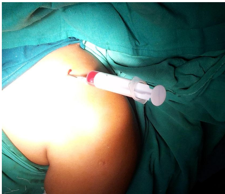
Figure 4: Intraoperative photograph showing blood-fluid in the cyst.