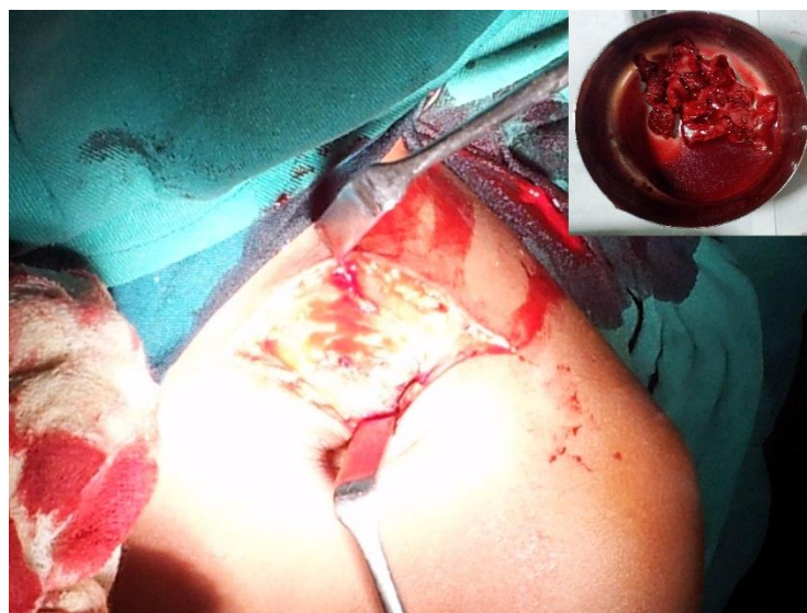
Figure 5: Photograph depicting multiloculated cyst containing streaks of thrombi.