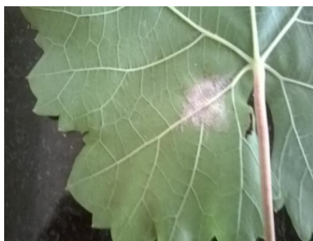
Figure 2: Downy mildew of grape