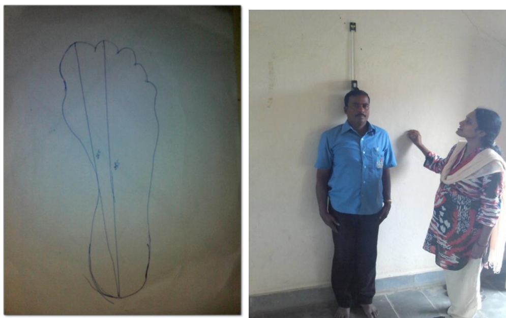
Figure: 1 showing measurement of length of foot and height of subjects.