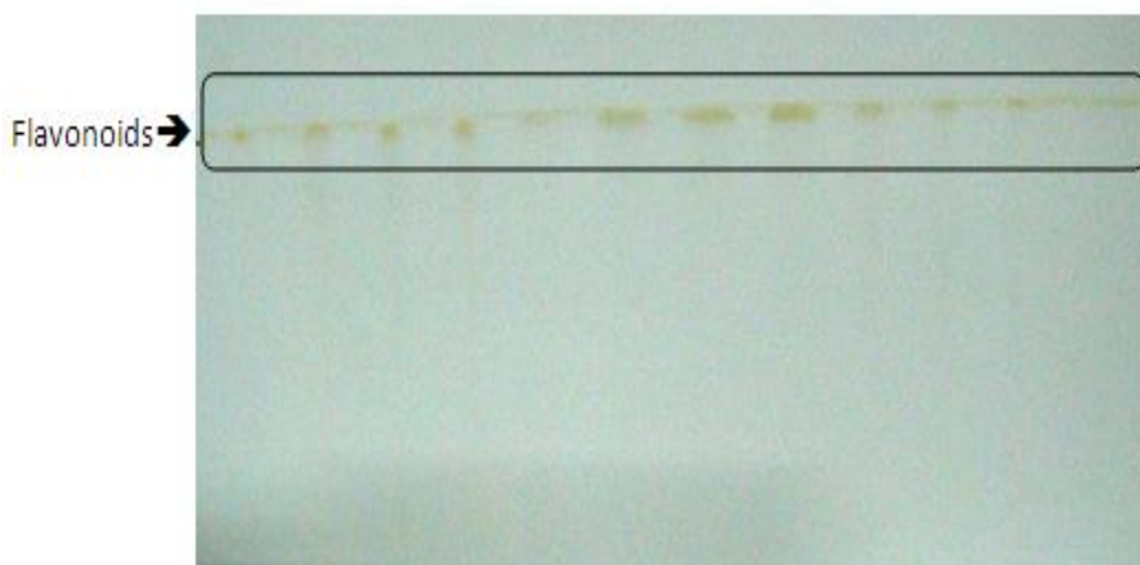
Fig. 1: HPTLC chromatogram showing flavonoids as yellow band

Identification of flavonoids in Chitosan treated cell suspension samples was done by High Performance Thin Layer Chromatography (HPTLC). Yellow coloured bands of flavonoids were visible on TLC plate after derivatization (Fig.1). The total flavonoid content in sample was measured by Aluminium Chloride assay. Chitosan concentrations 5 mg, 10 mg and 20 mg for 24 hr treatment duration showed 0.034 \pm 0.011 , 0.017 \pm 0.006 and 0.052 \pm 0.008 mg/g total flavonoid content respectively. The content was more as compared to control ( 0.021 \pm 0.007 mg/g) in 5 mg and 20 mg concentrations of Chitosan whereas 10 mg Chitosan showed less flavonoid quantity than control. Highest flavonoid content was observed in 20 mg concentration of Chitosan. In case of 48 hr treatment duration, total flavonoid content was noticed as 0.067 \pm 0.021 mg/g in 5 mg, 0.089 \pm 0.011 mg/g in 10 mg and 0.108 \pm 0.018 mg/g for 20 mg concentration in context to 0.044 \pm 0.009 mg/g in control. All the three studied concentrations showed gradual enhancement in total flavonoid content. Highest content was observed in 20 mg of Chitosan treatment. For 96 hr duration, 5 mg Chitosan showed 0.017 \pm 0.011 mg/g, 10 mg Chitosan indicated 0.056 \pm 0.013 mg/g and 20 mg Chitosan showed 0.081 \pm 0.010 mg/g flavonoid content against 0.023 \pm 0.009 mg/g in control.