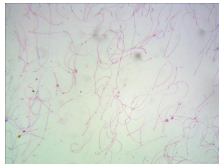
Fig 2 Semen smear (Papanicolaue stain)