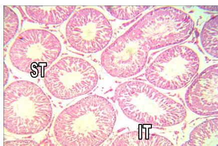
Fig 3. Control Rat testis