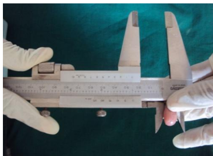
Fig 1 Measuring Testis

be empty, whereas other tubules had unequally distributed few spermatozoa Fig 4 & 6 .