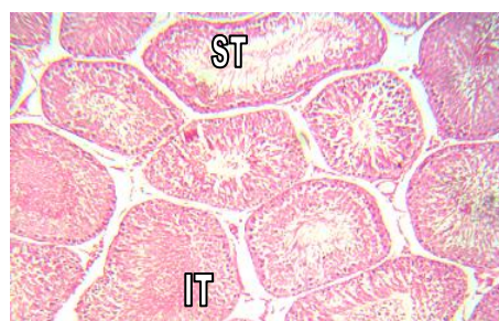
Fig 4. Experimental Rat testis (IT Moved out of the tube)

Histological analysis - young rat testis low magnification 10 X (Same level section)