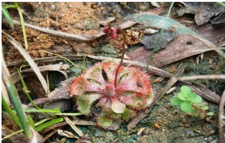
Fig-2: Photograph of Drosera sp was captured from Bolpur in West Bengal.

whereas some other species of Drosera favor to grow in shaded environments like D. adelae , D. prolifera , D. schizandra (7, 15).